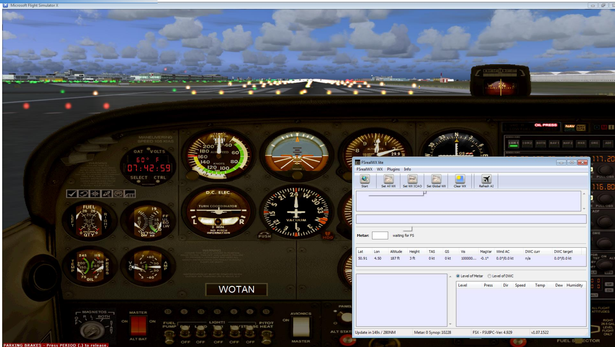
Idem with the Cessna at Brussels (EBBR Rwy 25 R) the same day 24/10/2014 trying to get WX lite Message %waiting for FS+